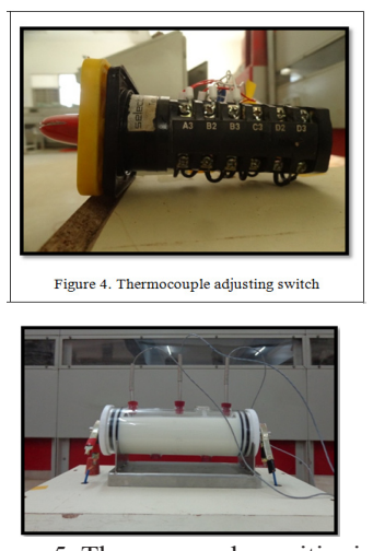
Figure 5. Thermocouple positioning

Power from Domestic supply (220V, 50Hz) was used. Voltage was supplied to the electrodes at the end sides. Digital ammeter was used to measure the amount of current in amperes. It displayed the output on an electronic display and is more precise and more